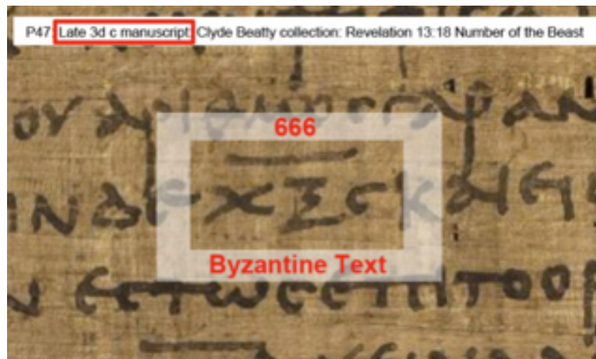
FIGURE 2: 3rd Century AD Bible Manuscript Showing 666 in Revelation

ii. This theory targets Islam as the final Beast Empire that will dominate end–times history. With this in mind, proponents of this