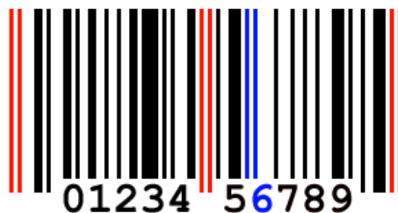
FIGURE 1: Typical Universal Product Bar Code